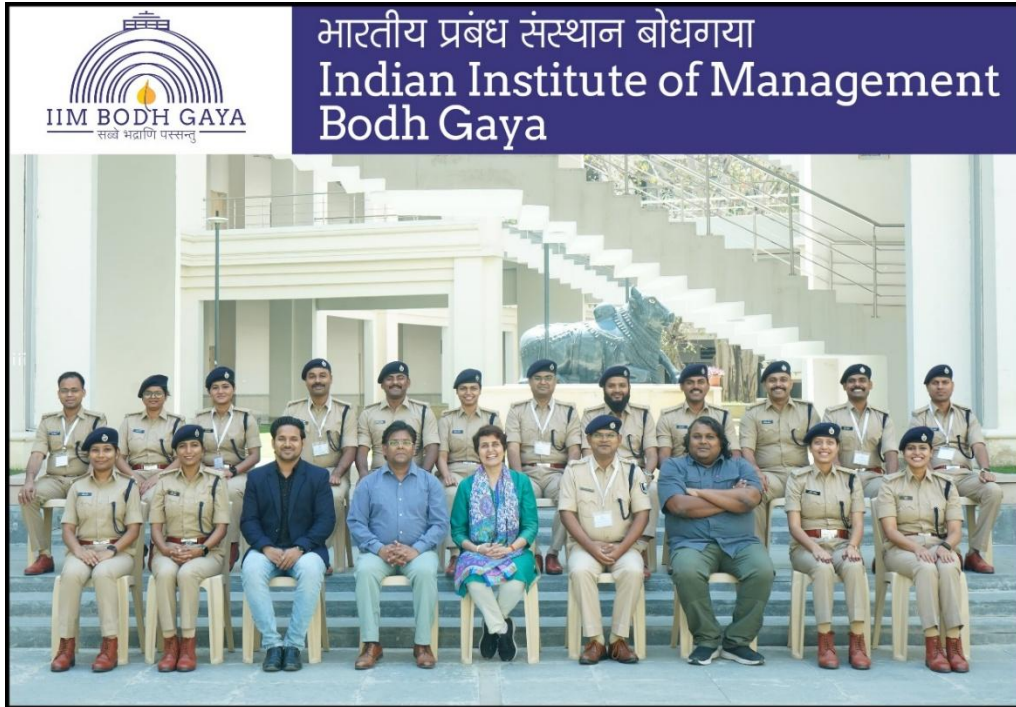
Group photo of District Fire Officers with Director IIM Bodh Gaya, Chairperson Executive Education & Consultancy and Programme Coordinators