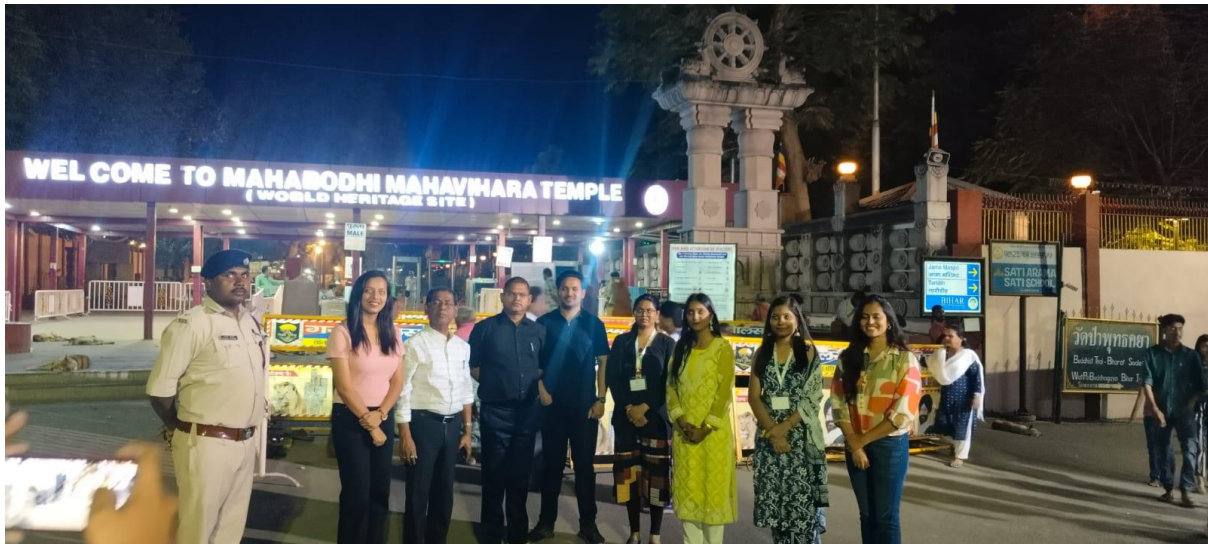
Mahabodhi Temple Bodh Gaya visit