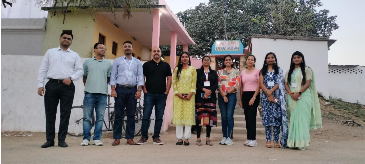
Sujata Temple Bodh Gaya visit