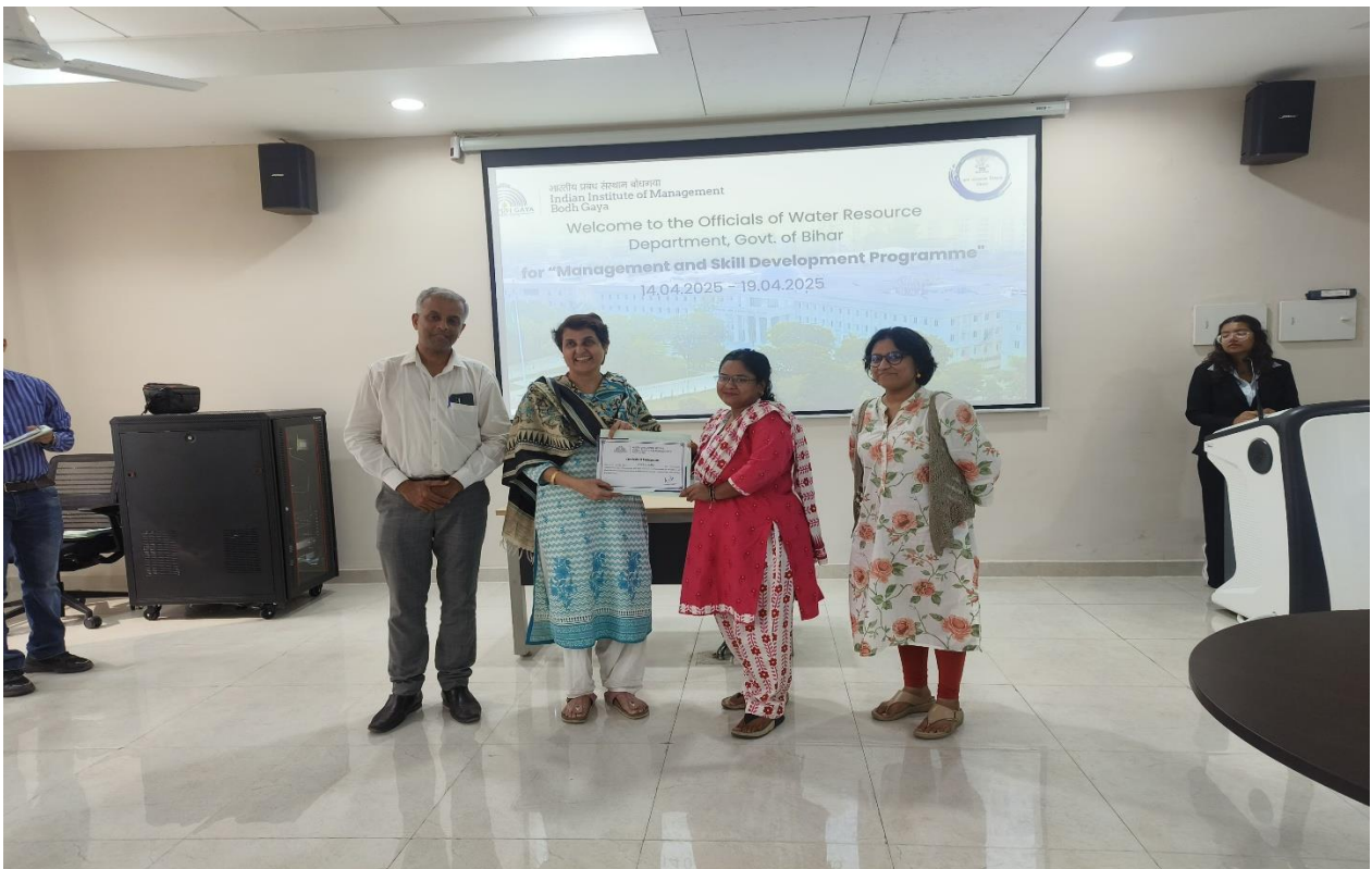
Figure. 12 Valedictory Session