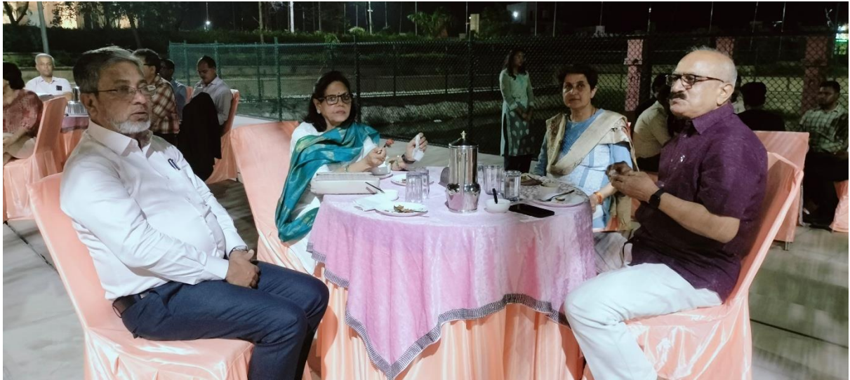
Figure 9. Director's Dinner