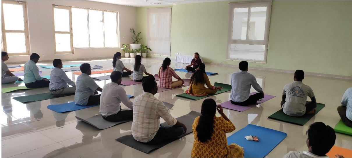
Figure 10. Meditation Session

sessions provided valuable insights and skills for the WRD Batch 8 participants. The second half of the day was dedicated to the Outbound Program, where participants visited the Rubber Dam and the Mahabodhi Temple.