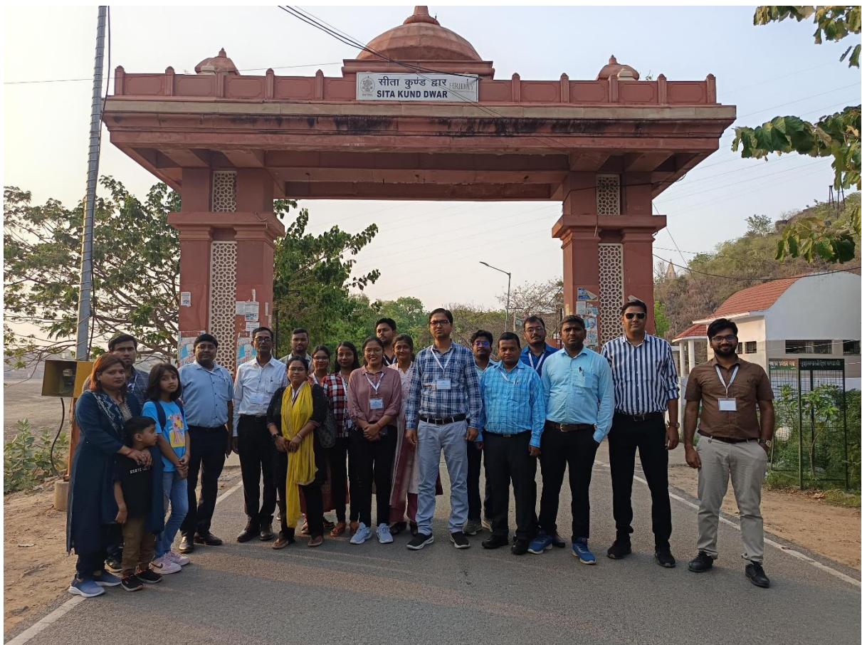
Figures 6. & 7. Outbound Programme