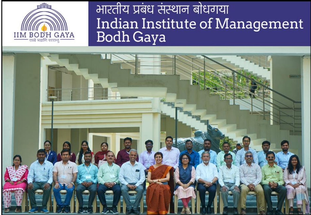
Figure 1. IIM Bodh Gaya Campus

The Management Development Program (MDP) sessions at IIM Bodh Gaya are designed to enhance the skills and knowledge of government officials in various management disciplines. These sessions provide valuable insights into contemporary business practices, management theories, and leadership skills that are crucial for organizational success.