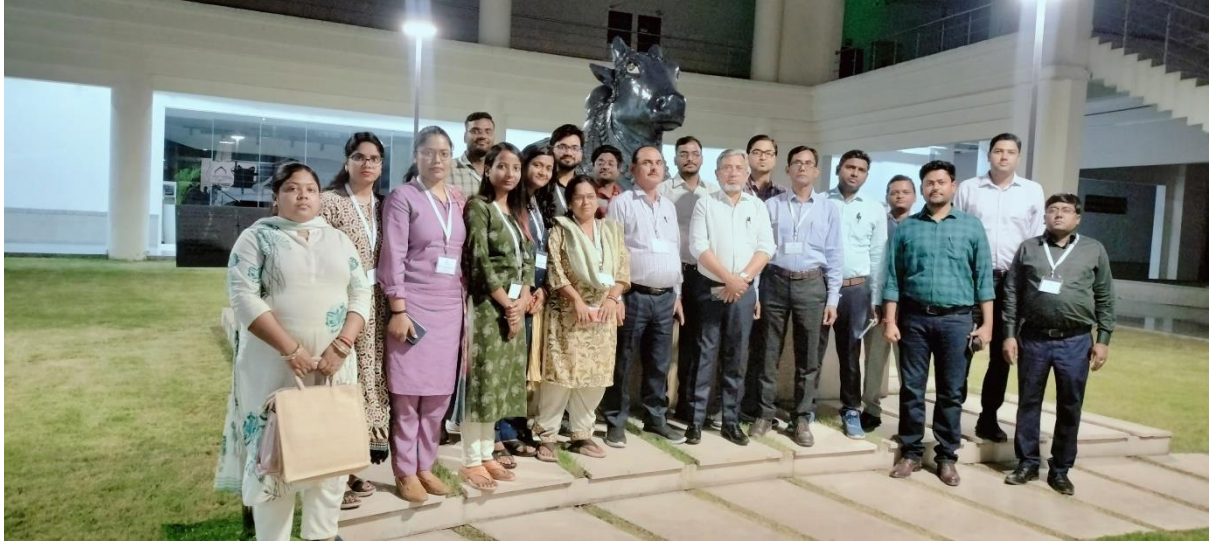
Figure 8. Campus Visit