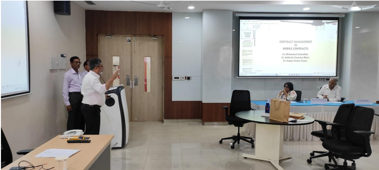
Figure 11. Presentations