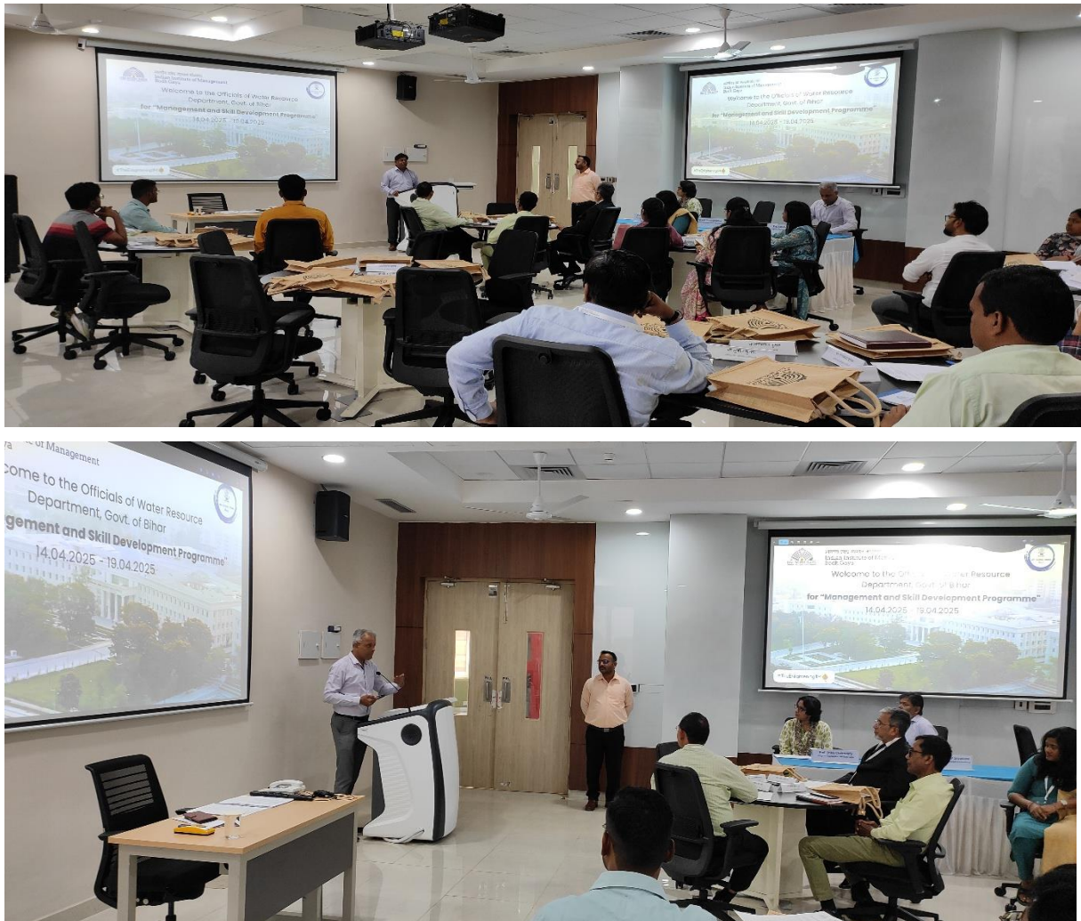
Figure 3. Inaugural Session